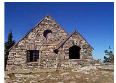
Historic Structure: Vista House at mountain summit

Washington State Parks initiated a multi-phased roadway project to repair and improve the existing park access road. Osborn Pacific Group completed multiple tasks for this project, including conducting a wetland reconnaissance to identify jurisdictional wetlands along 4.5 miles of road, preparing wetland and stream mitigation and roadside restoration plans, coordination with regulatory agencies, permitting, and preparation of the expanded SEPA checklist.